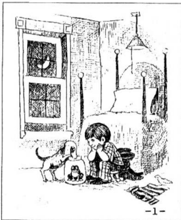
Figure 1. Boy and frog picture

that give structure to the narratives and can be used to provide a semantic score as a measure of information included. Data have been collected using this task from typically developing children and adults (Bamberg and Damrad-Frye 1991, Reilly 1992, Berman and Slobin 1994, Wigglesworth 1997) and special developmental populations including children with autism (Tager-Flusberg 1995) and children with focal brain injury (Reilly et al. 1998) as well as those with language impairment (Van der Lely 1997, Botting 2001, Norbury and Bishop 2003, Reilly et al. 2003). In this study, the protocol used by Van der Lely (1997) was followed to collect the narratives (figure 2a). Adolescents are asked to choose a story from an envelope so that the researcher apparently does not know which story has been picked. This encourages thorough and complete narratives with no 'assumption of knowledge'. Note that while in this procedure adolescents were told that there were four different but similar stories, in fact each envelope contained the same 'Frog Story' as described above. This procedure was used because following Van der Lely (1997), it was thought to be an appropriate protocol to encourage complete narratives from participants in the adolescent age range. It also meant that data collected would be comparable in kind to previously reported studies. The present study also encouraged the adolescents to tell the narratives in the past tense. This was done